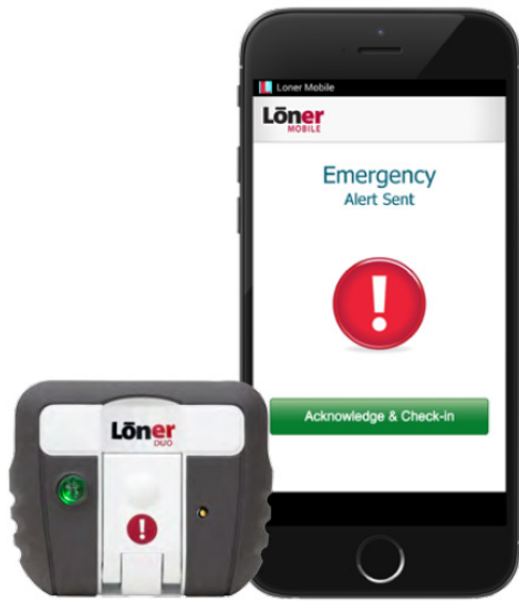
Loner Duo complements the Loner Mobile safety monitoring application