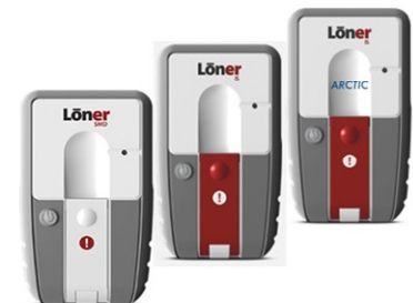
Loner Beacons communicate with the Loner M6, Loner M6i and Loner 900